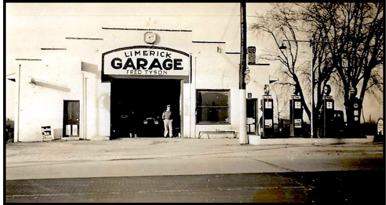
Pottstown Mercury - 24 Aug 1953