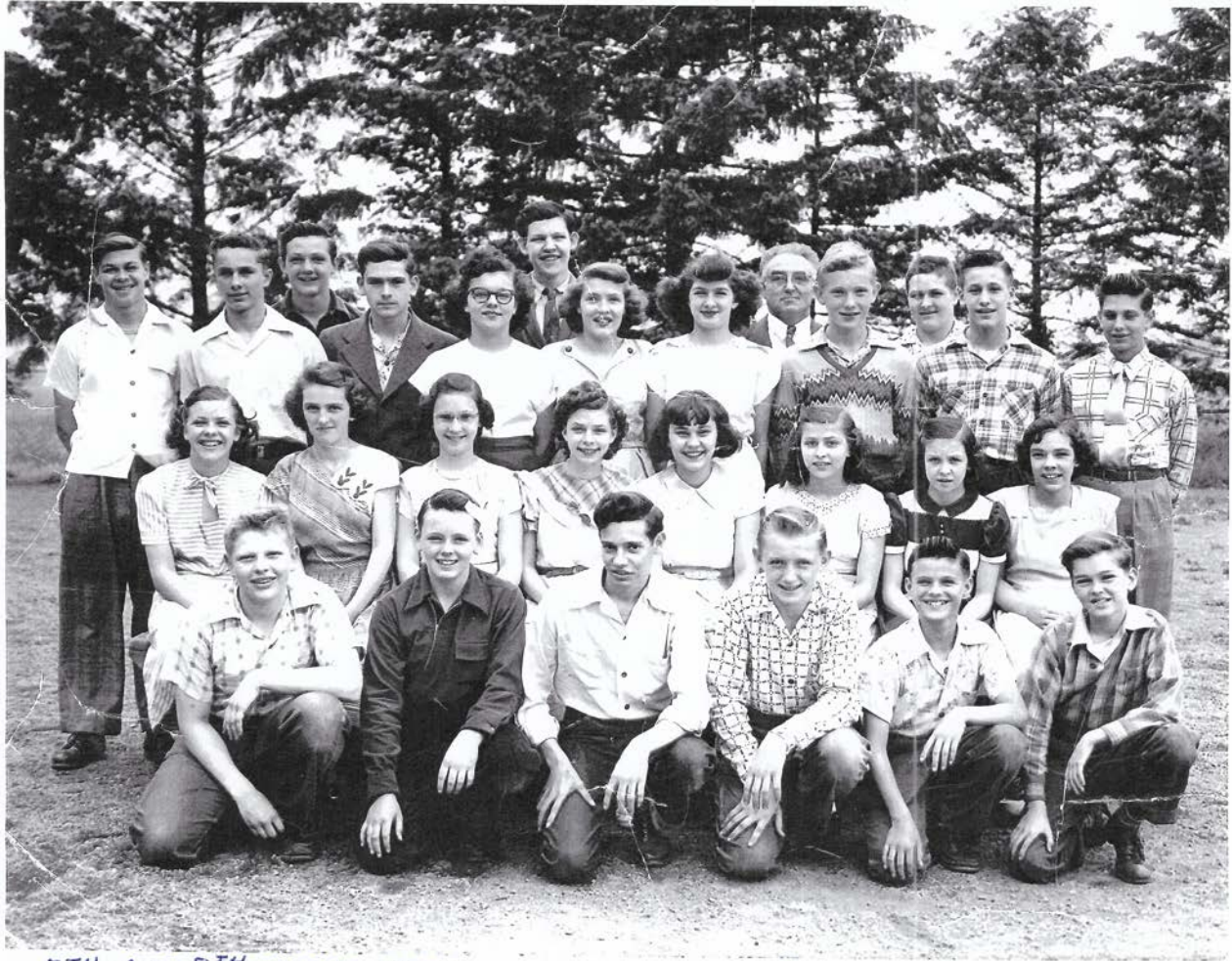
7TH AND 8TH GRADE, LIMERICK GRADE SCHOOL 1950